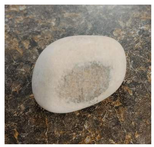
"Let anyone who can hear, listen to what the Spirit is saying to the churches: to those who prove victorious I will give some hidden manna and a white stone, with a new name written on it, known only to the person who receives it." - Revelation 2: 17

Ever since I was an infant, I've been in awe of and curious about everything. The beauty of life, the mysteries of God, refractions of light, water, motions, the people I met, seasons, colors, abstract reasonings, patterns, storms, insects, stories, lore, rules, even computer programming... everything.